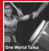
One World Taiko